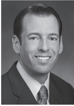
Senator Andy Billig

DISTRICT OFFICE: 25 West Main, Suite 237 Spokane, WA 99201 (509) 209-2427