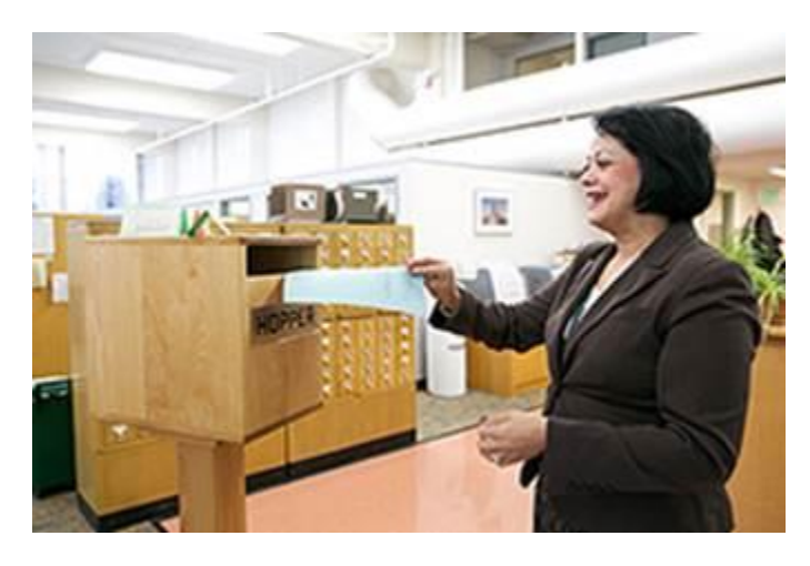
managed to prime sponsor some Dropping my first bill into the <u>Hopper</u> . bills, including these two pieces of legislation I am certain will make a difference in the lives of many of our children:

Just a couple of weeks in and I've already met with constituents and stakeholders who have taken time out of their busy schedule to share their concerns and passions with me. I am pleased to say that, although I came in late with a tight deadline to draft bills, I managed to prime sponsor some