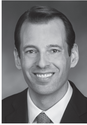
Senator Andy Billig

DISTRICT OFFICE: 25 West Main, Suite 237 Spokane, WA 99201 (509) 209-2427