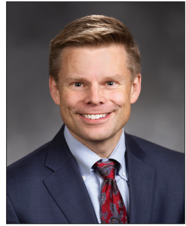
SENATOR Jamie Pedersen

TRANSIT: The theater is served by nearby bus lines, including the 2, 9, 10, 11, 43, 49, 60, and 84.