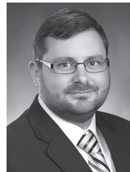
Rep. JD Rossetti