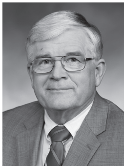
Sen. Dean Takko

PO Box 40600 Olympia, WA 98504-0600 Phone: 360-786-7806 E-mail: JD.Rossetti@leg.wa.gov