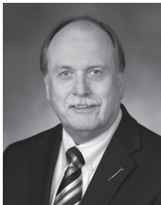
Rep. Mike Sells