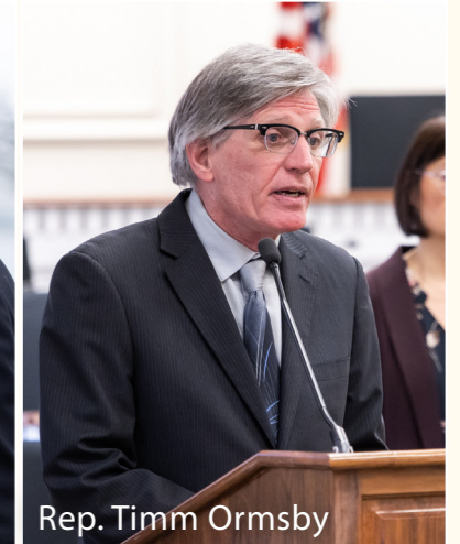
Rep. Timm Ormsby