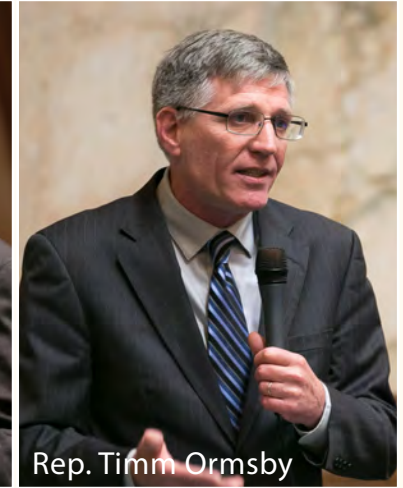
Rep. Timm Ormsby