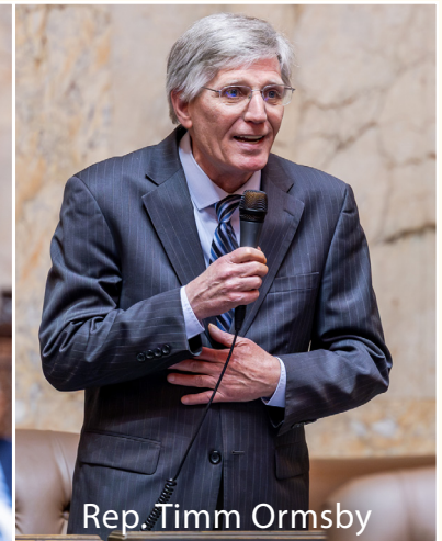
Rep. Timm Ormsby