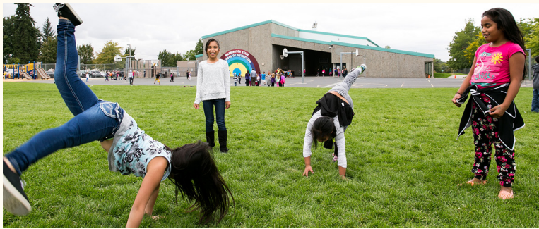
The Legislature kept its commitment to Washington's 1.1 million K-12 students.