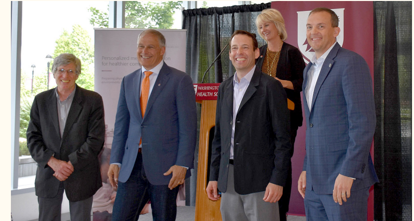
Celebrating the expansion of the WSU medical school with Gov. Inslee in June.