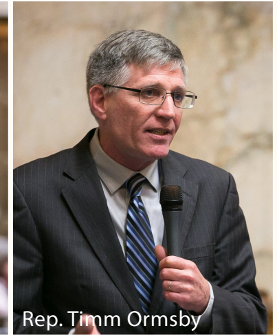
Rep. Timm Ormsby