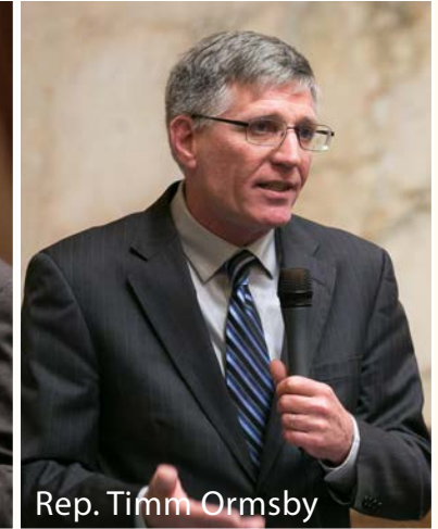
Rep. Timm Ormsby