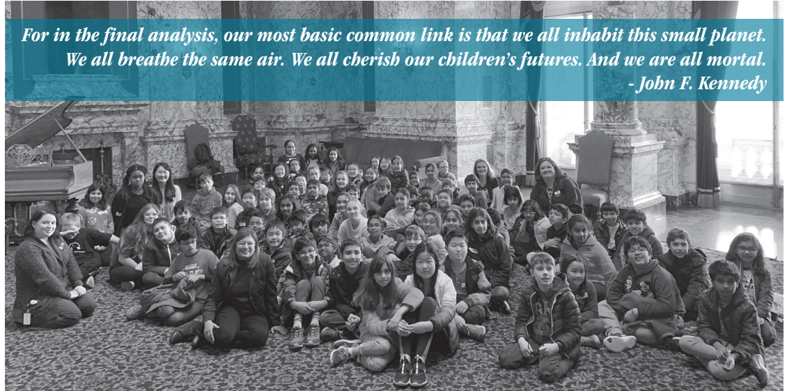
Redmond Elementary School students visiting on February 24, 2020

For in the final analysis, our most basic common link is that we all inhabit this small planet. We all breathe the same air. We all cherish our children's futures. And we are all mortal. - John F. Kennedy