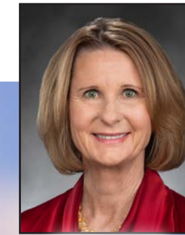
SENATOR Patty Kuderer