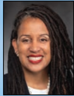
STATE REPRESENTATIVE April Berg