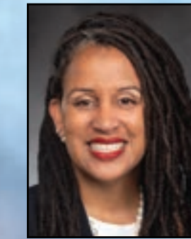
STATE REPRESENTATIVE April Berg

PRSRT STD US POSTAGE PAID SEATTLE, WA PERMIT NO. 2303